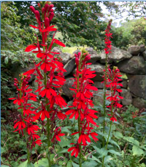
Summer Botanical Spotlight Tours