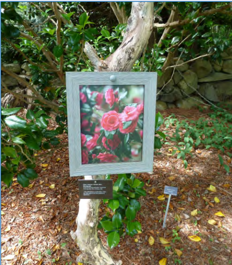
Art in the Arboretum

Included with $10 admission (free for PHA members).