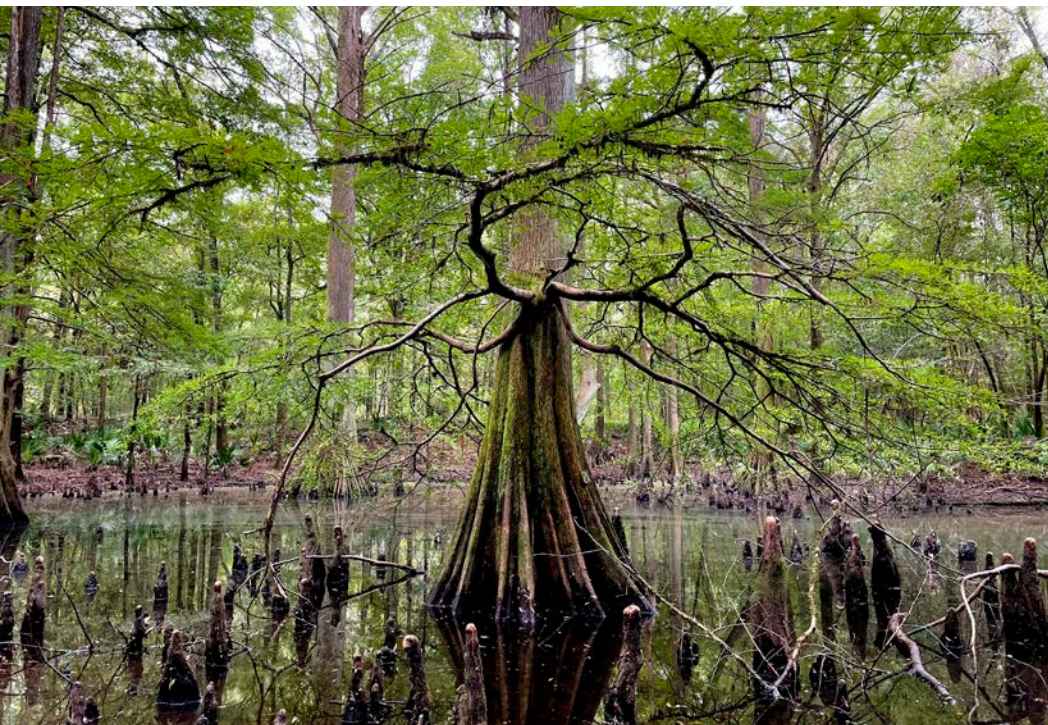
A baldcypress and tupelo swamp at Solon Dixon Preserve in Alabama

Essentially strong, straight canes with the nub of a branchlet left at one end, the higher stewartia branches could be hooked and flexed downward to allow for harvesting the fruit without damaging the branches. Satisfying in their rustic practicality, they would have come in handy during the first leg of our trip!