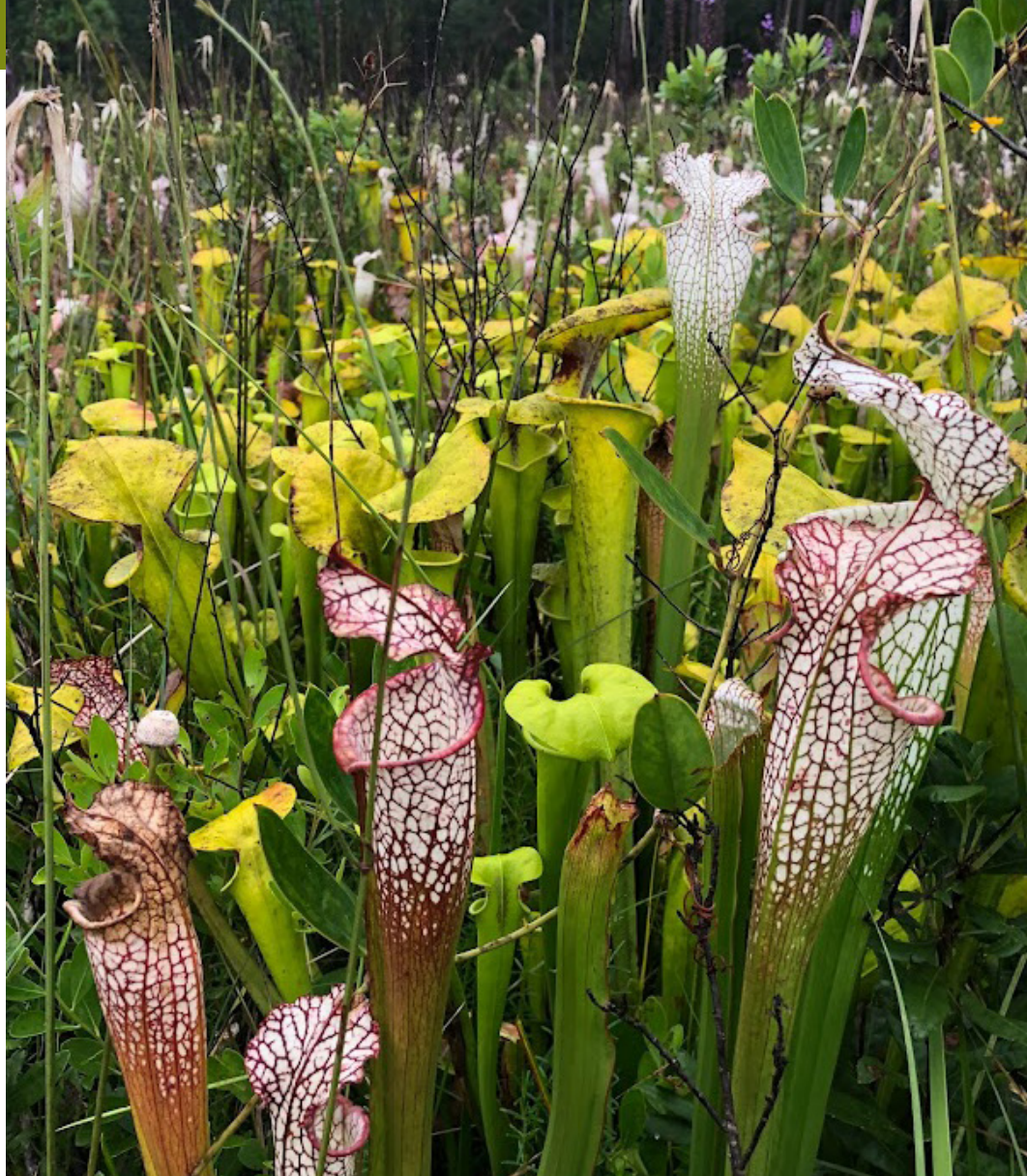
Crawford Bog in Alabama's Conecuh National Forest