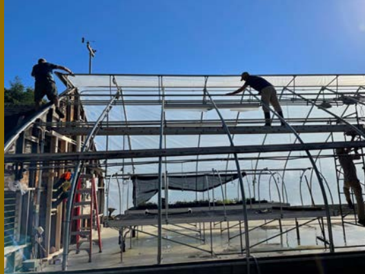
Staff replace plastic on one of the PHA greenhouses.