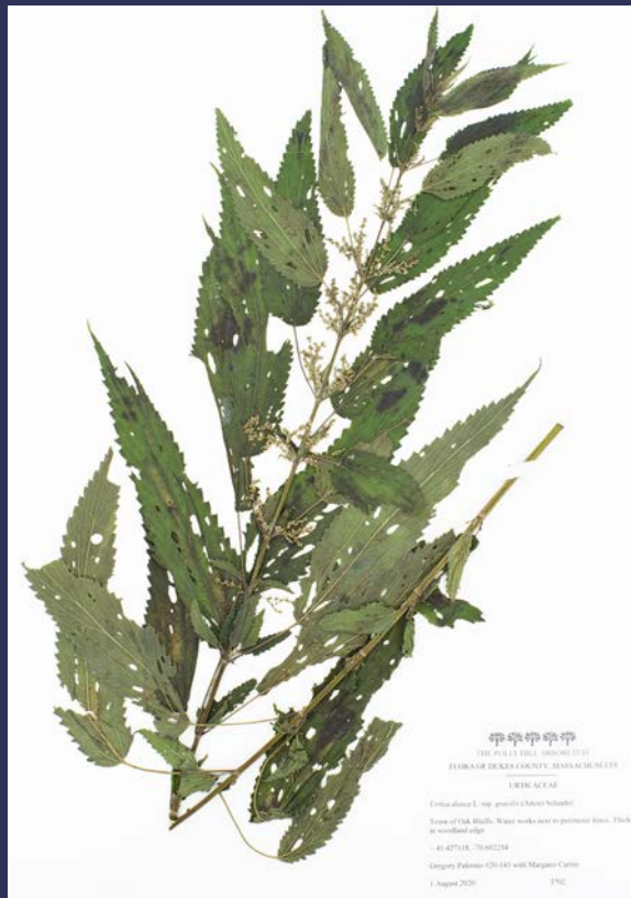
Urtica dioica ssp. gracilis

We have two subspecies of stinging nettle on the Island: the American stinging nettle ( Urtica dioica ssp. gracilis ), an MV native plant, and the exotic European stinging nettle ( Urtica dioica ssp. dioica ). Though it may not be obvious to the untrained observer, the most notable difference between the two is in the flower: our native nettle is monoecious, which means it has both male and female flowers coexisting on the same plant. On the other hand, European nettles exhibit either all male or all female flowers. Another clue can be taken from the subspecies