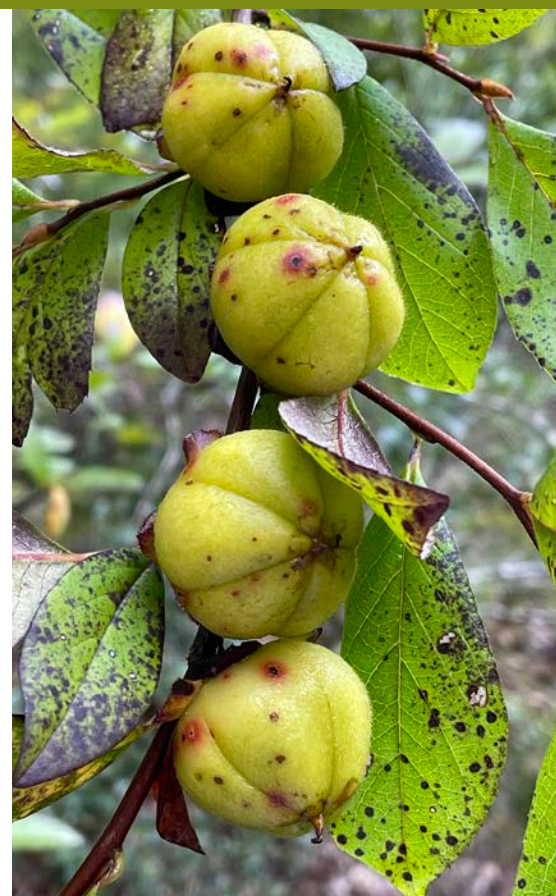
The exceptionally large fruits of silky camellia, found in the panhandle of Florida

Silky camellia is primarily found on the coastal plain, growing on the slopes of sandhills or rich ravines, while mountain camellia has a more central distribution in the moist hardwood and bluff forests of the lower Appalachian Mountains and Piedmont Plateau. Although its range stretches along the coast from Virginia to Texas, we decided to target silky camellia in the panhandle of Florida and adjacent southern Alabama. These populations are both underrepresented in cultivated collections and at a higher risk of natural habitat destruction due to development, hurricanes, and other climate change-related risks. Conveniently for us, this region is also home to the red-listed (i.e. of conservation concern) bluff oak ( Quercus austrina ), which we also planned to seek out.