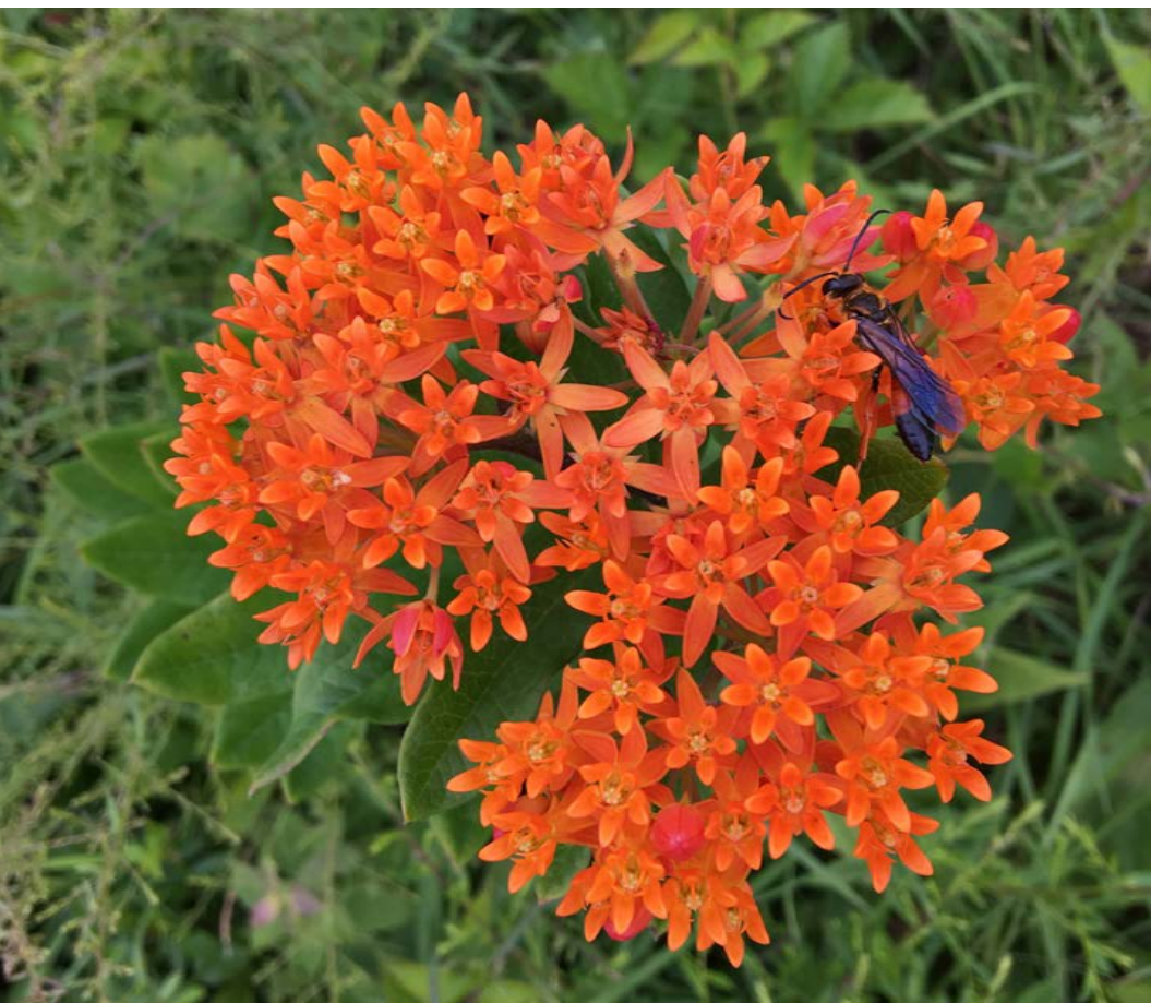
Butterfly weed is a larval host of the monarch butterfly as well as a food source for many native Island insects.

One compelling reason to reintroduce plants of the milkweed genus into our local ecosystem is its importance to monarch butterflies, whose population numbers are declining rapidly. Monarchs depend on the availability of these plants as food for their larvae. And while monarchs may be the