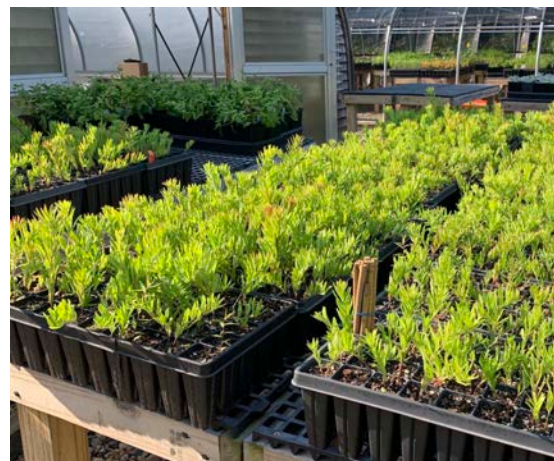
Butterfly weed seedlings growing in plug trays in the PHA plant production area

most well-known species to utilize milkweed, numerous other types of butterflies, as well as moths, bees, flies, and beetles, all use milkweed plants as a food source. The Asclepias planted at Bamford Preserve will play an important role in the health of its grassland ecosystem.