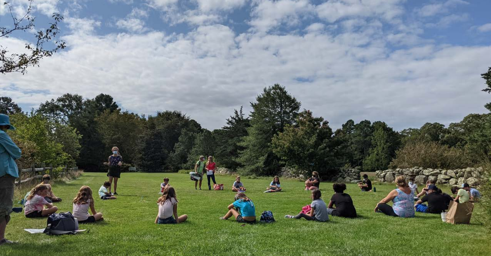
Fourth grade students prepare to be “Tree Detectives” as they explore the Arboretum.