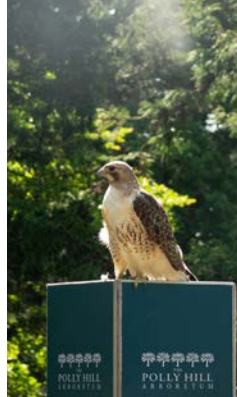
A red-tailed hawk stops by the Visitor Center.