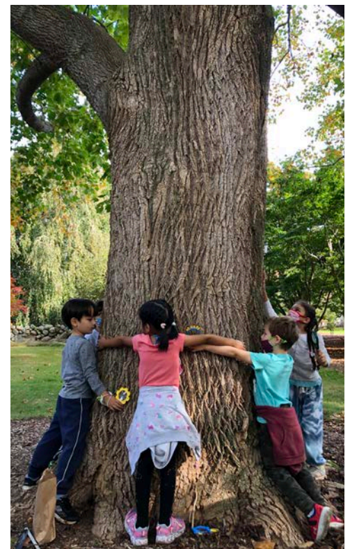
Oak Bluffs kindergarteners embrace a tulip tree after examining its unique seed pods.

self-guided activities for children and families. If you didn’t catch our autumn leaves scavenger hunt, try out the winter tree ID brochure, and keep an eye out for the return of our popular gnome hunt. See you out on the grounds!