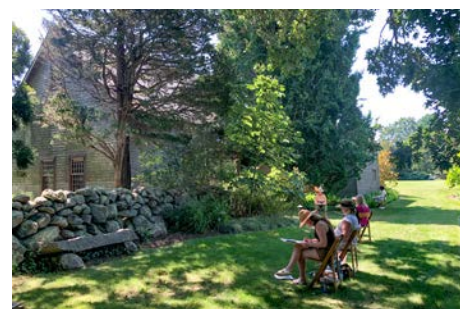
Students in a nature drawing class take in the sights.