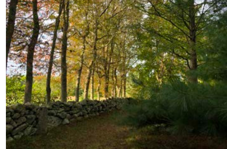
Fall colors among the beetlebung trees