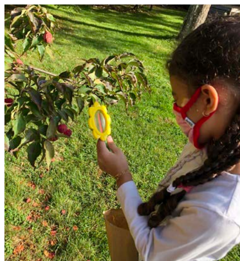
A kindergarten student investigates kousa dogwood fruits.

Our educational offerings, which tie in with the State’s science standards for each grade, include a lesson in the classroom that prepares students for what they will see