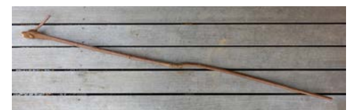
A stewartia harvesting tool fashioned from a sourwood stick

Returning to the Island with an abundance of seed from our target species, we declared the trip a success, made possible by many parties to whom we are massively grateful. We thank the Plant Collecting Collaborative, who helped fund our travels, and the myriad people who assisted with the permitting process, site selection, and guidance in the field.