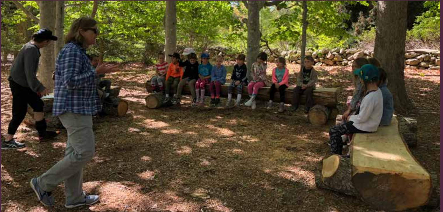
Martha's Vineyard Charter School students gather to learn about flowers and pollination.