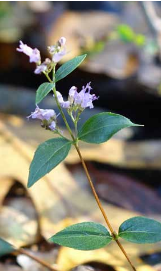
American Dittany in flower

PHA explored the forests and swamps of western Tennessee and Kentucky in September 2017 to collect seed for the living collection. The expedition, branded “TNKY,” was a collaborative venture with Bartlett Arboretum, Chicago Botanic Garden, the Morton Arboretum, and the U.S. National Arboretum. This physiographic region is known as the Mississippi Embayment, a massive basin that drains into the Mississippi River. The comparatively young, rich soils deposited by changing river courses over thousands of years now support unique wetland communities and bottomland hardwood forests. The suitability of these soils for agriculture has subsequently turned much of the region into farmland and left a fragmented array of small forests. Although the majority of the TNKY expedition concentrated on tree species such as oak, hickory, water tupelo, and silverbell, we also gathered some noteworthy perennials entirely new to PHA. Here are a few that in only two years’ time are already thriving on the grounds.