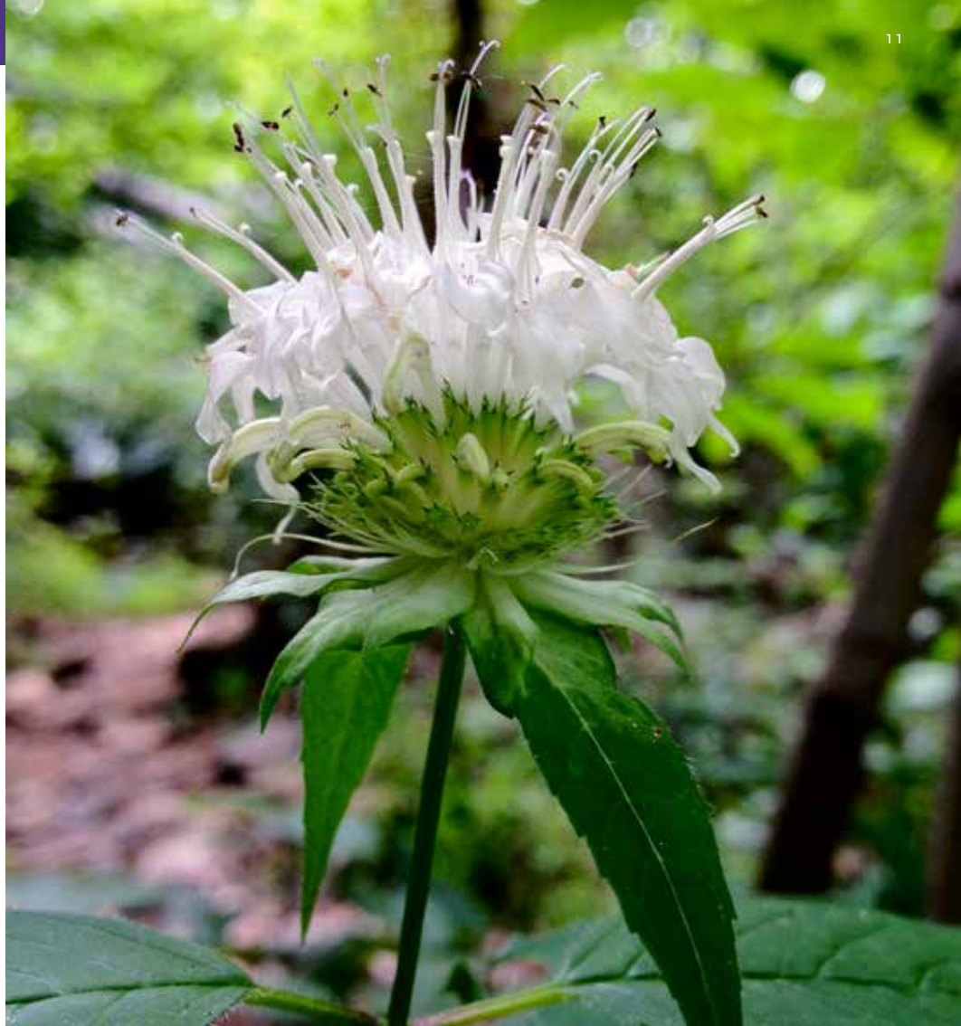
The flower of white bergamot

For those that have visited PHA in autumn, Melanthera is hard to miss. Growing in a mass between the plant sale area and the Visitor Center, this perennial begins flowering in late summer and continues until frost. The spherical white flowerheads support a plethora of pollinators. An additional ornamental aspect of this species are its quadrangular stems, which are heavily mottled with purple spots. Our collection was made near Paducah, Kentucky, on the edges of an oxbow lake formed by the Ohio River. This happens to be the northern extent of snow squarestem’s range, but this species occurs southward into the Caribbean, Mexico, Central America, and South America. A fascinating fact: a recent study found Melanthera growing in the ash of an active Nicaraguan volcano, where a native bee species derives 99 percent of its