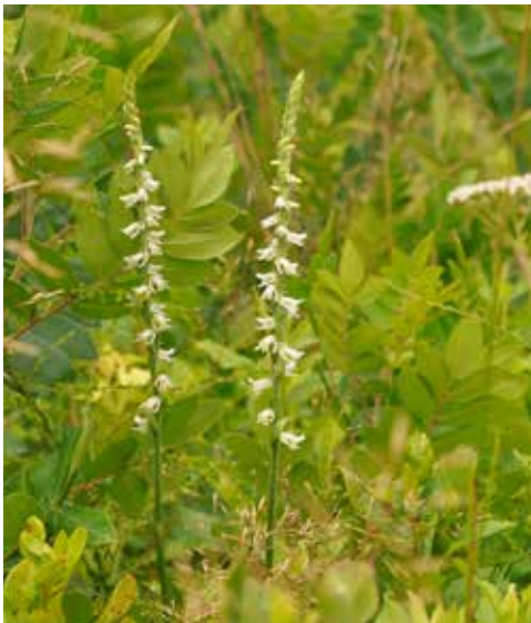
Spring ladies' tresses blooming among the sumac in the North Field

management strategies should be adjusted. It also gives us a snapshot of what our plant community currently looks like. We are still analyzing the data, still taking measure, but we hope to find some interesting and actionable results. We're excited to watch our meadows continue to evolve towards greater diversity of native grasses and wildflowers.