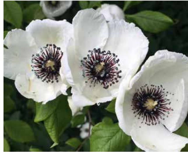
A bountiful season of spectacular blooms at the PHA this past year. From top, left to right: Narcissus 'Ceylon,' beautybush (Kolkwitzia amabilis), Rhododendron 'Sunlight,' and silky stewartia (Stewartia malacodendron).