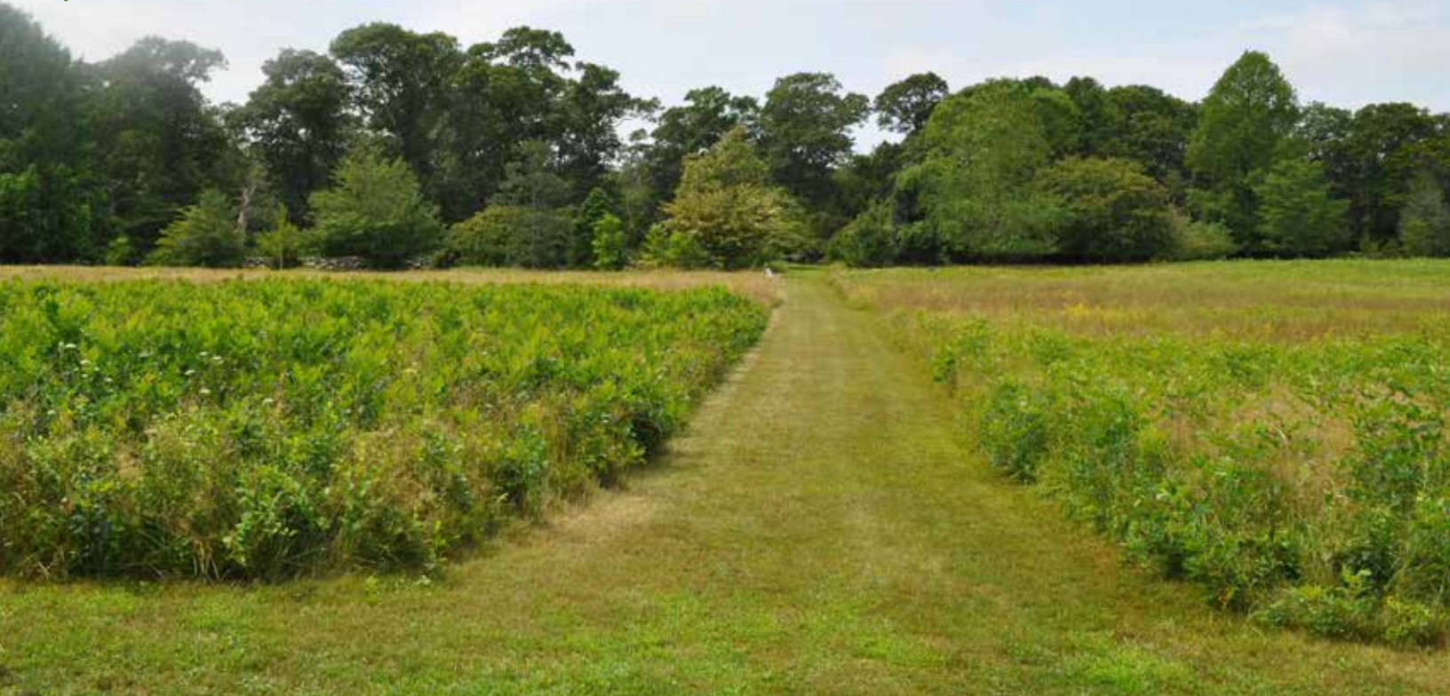
A large thicket of sumac on either side of the entrance to the West Field

At PHA the North Field and West Field, informally called “the meadows,” have had different characters and purposes throughout the property’s history. When Polly Hill inherited the property in 1956, these fields, which had been maintained as pastureland and hayfields in the 19th century, had already succeeded to scrubby shrublands. When Polly began her regimen of annual mowing, she had conservation in mind: conservation of the Island’s rural character that she called “quintessential Vineyard vistas.”