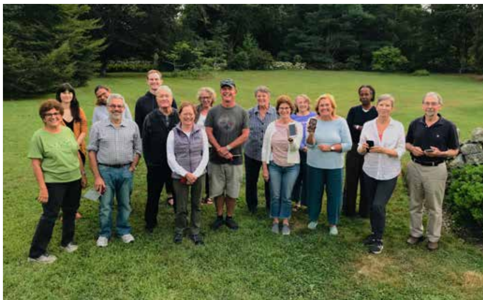
Students in the nature photography for smartphone users class.

All season long, it was a joy to see so many interpretations of PHA, whether scientific, horticultural, creative, or therapeutic, through the eyes of artists. We welcome visual artists to the Arboretum during daylight hours year-round, and we encourage everyone, from art appreciators to seasoned professionals, to look for more artistic offerings in our next program guide.