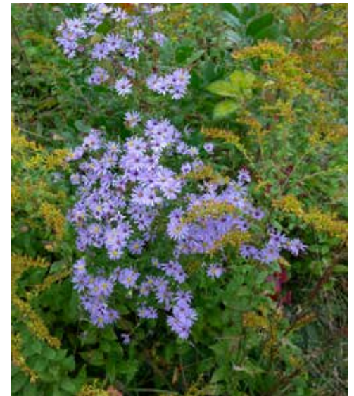
Native purple wavyleaf aster and wrinkle-leaved goldenrod