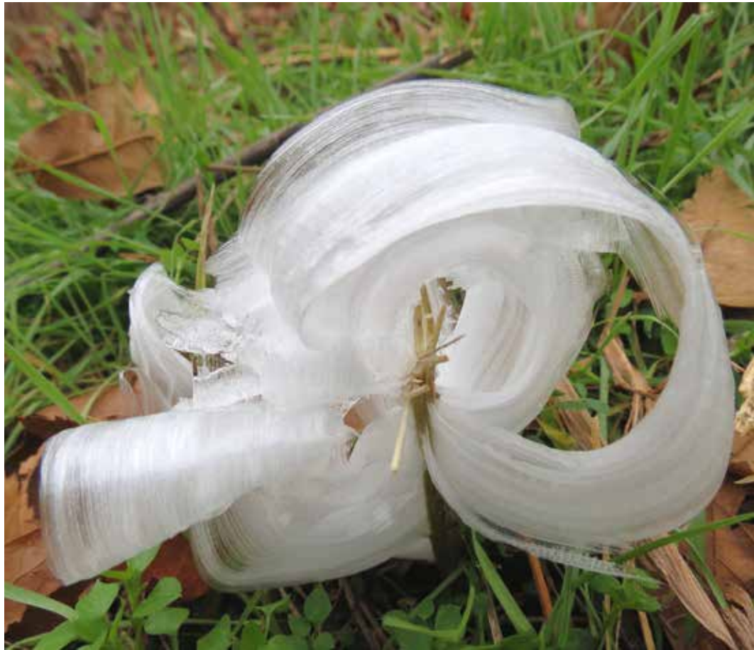
The “frost flower” phenomenon that can occur on the stem of American dittany during certain cold conditions

PHA explored the forests and swamps of western Tennessee and Kentucky in September 2017 to collect seed for the living collection. The expedition, branded “TNKY,” was a collaborative venture with Bartlett Arboretum, Chicago Botanic Garden, the Morton Arboretum, and the U.S. National Arboretum. This physiographic region is known as the Mississippi Embayment, a massive basin that drains into the Mississippi River. The comparatively young, rich soils deposited by changing river courses over thousands of years now support unique wetland communities and bottomland hardwood forests. The suitability of these soils for agriculture has subsequently turned much of the region into farmland and left a fragmented array of small forests. Although the majority of the TNKY expedition concentrated on tree species such as oak, hickory, water tupelo, and silverbell, we also gathered some noteworthy perennials entirely new to PHA. Here are a few that in only two years’ time are already thriving on the grounds.