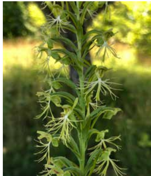
Ragged fringed orchid blooming in the West Field in July