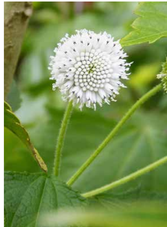
The distinctive flowers of snow squarstem

This subshrub from the mint family (Lamiaceae) reaches only 12 to 18 inches in height and width. It occurs naturally in open, hardwood forests, often in dry upland sites with shallow soils that limit competition from other plants. Our collection came from a steep, rocky, south-facing hillside in Tennessee that was dry and moderately sunny. Cunila has proved remarkably adaptable at PHA, and thus far, the plants have proved to be deer resistant. Its small size positions Cunila as a front-border plant, which is an ideal location to appreciate its small, fragrant, pink-to-purple flowers. Another wonderful attribute of this perennial is its extended flowering time; it begins in late summer and is still going strong and attracting bees in mid-October. Although it is adaptable to richer garden soils, care should be taken to ensure the soils are well drained. Avoid planting Cunila near larger, aggressive perennials that will crowd it out. A rare but