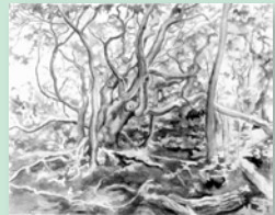
Drawing by Lizzy Schule

Join local artist Lizzy Schule for a series of nature drawing classes. Each class will cover a different topic in landscape drawing, accessible to all students, whether enrolled in an individual class or the entire series. Lizzy will address a variety of methods and themes that concern the landscape artist, such as materials, composition, perspective, shading, modeling form, and creating texture. She says: "We will have fun! Observing the subtleties of the natural world enriches your curiosity and creativity." Students will use a combination of graphite, charcoal, and pen and ink. Participants will need to provide their own supplies; a materials list is available. $55 per class ($40 for PHA members). Space is limited. Please pre-register. This class will be held at the Arboretum.