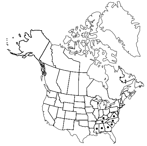
Natural distribution in North America of silky stewartia (left) and the mountain camellia (right). Maps courtesy of the Flora of North America