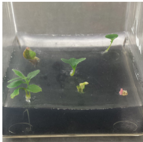
Embryonic tissue from Stewartia ovata 'Red Rose' is placed in agar with plant growth hormones allowing small plants to flourish without the strong growth inhibitors typically found in the woody seeds of some stewartia.

At PHA, Plant Propagator/Horticulturist Brian McGowan has been successful with growing certain stewartias from cuttings including several of Polly's Asiatic introductions. In the past we have rooted cuttings, however, the following year the small plants unfurl new leaves only to rapidly perish. We hypothesize that the cuttings do not produce enough growth to accumulate the necessary carbohydrate reserves to support growth the following season. Brian has worked hard to circumvent this through striking cuttings earlier in the season. In addition, the small trees are overwintered in the protective confines of the greenhouse.