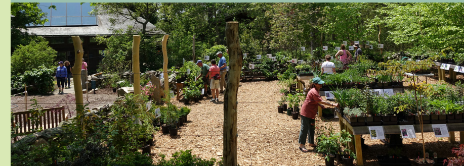
PHA Spring Plant Sale 2016.