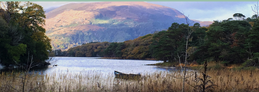
Lough Leane, County Kerry, Ireland.