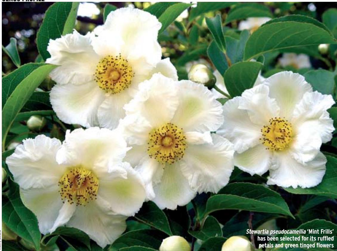
Stewartia pseudocamellia 'Mint Frills' has been selected for its ruffled petals and green tinged flowers