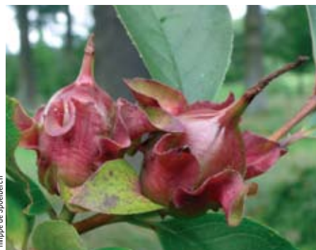
Stewartia rostrata is distinguished by its wavy-edged sepals and the red fruit is one of its ornamental characteristics

In the UK, High Beeches Gardens holds the National Plant Collection of Stewartia , although other gardens in the area, such as Wakehurst Place, Borde Hill and Nymans have respectable, if not venerable, specimens. Despite the youth of the trees, Arboretum Wespelaar and Garden of Herkenrode, Belgium, has an impressive collection with some of the species planted as groves.